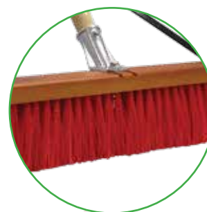
Heavy Duty Bristles