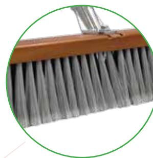
Stapleset Polypropylene Bristles