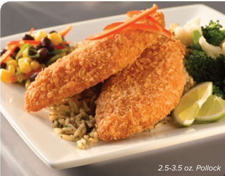
2.5-3.5 oz. Pollock