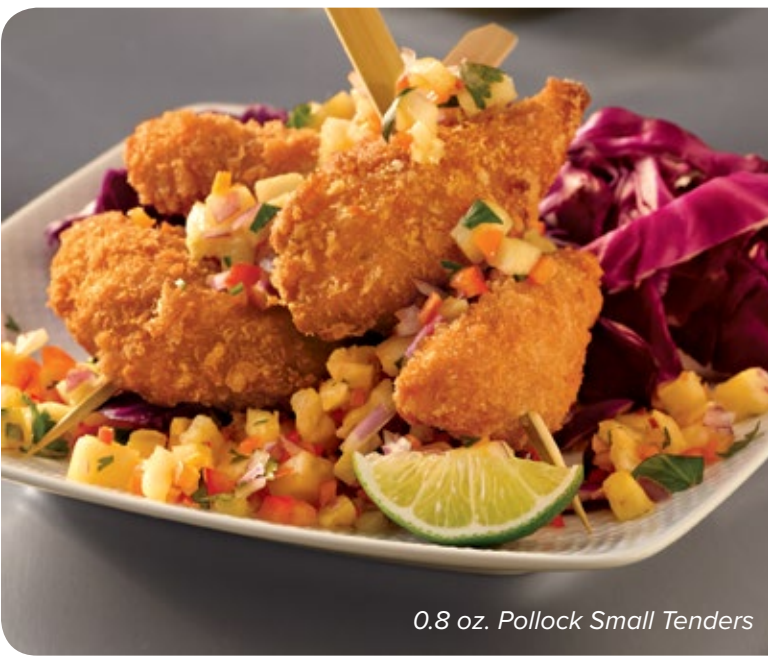
0.8 oz. Pollock Small Tenders