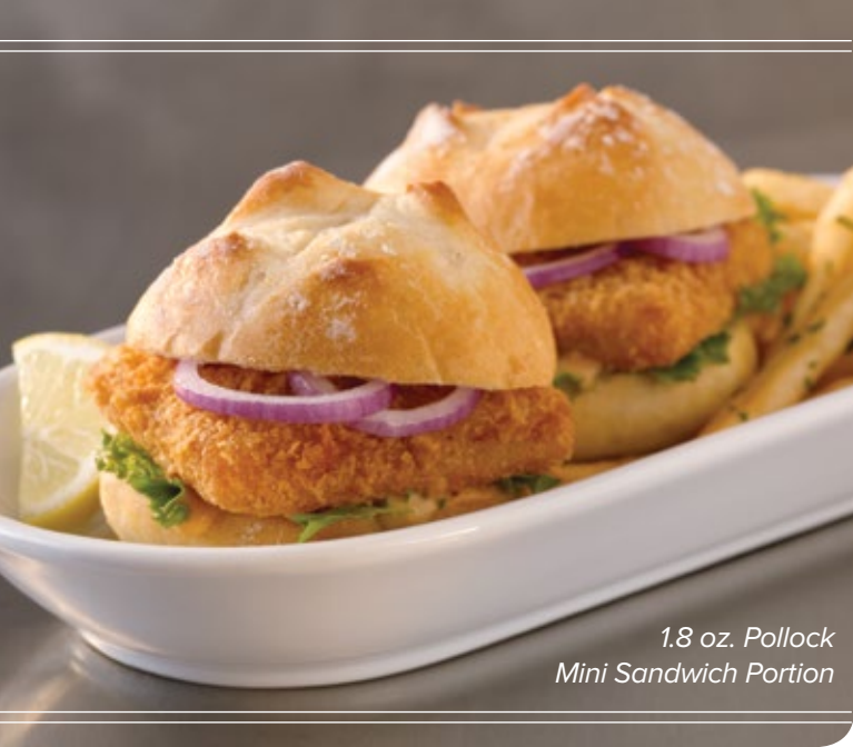
1.8 oz. Pollock Mini Sandwich Portion