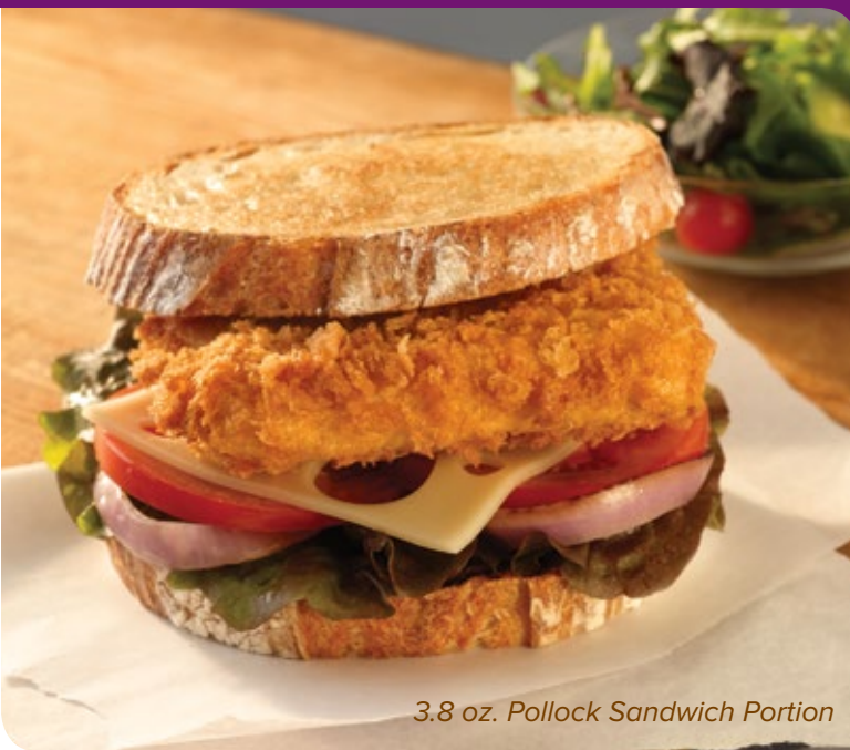
3.8 oz. Pollock Sandwich Portion