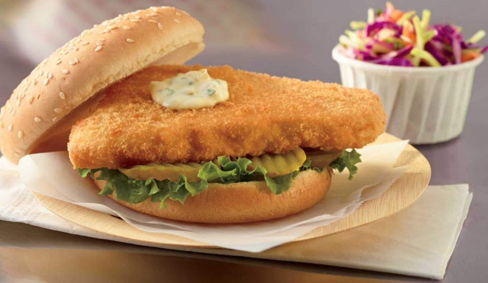
4 oz. Cod Wedge

Whichever variety you choose, know that you’re picking a great piece of fish from America’s leading seafood producer. Call us today and see what Trident can do for you.